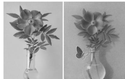
4. Reference photo and painting in black & white