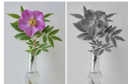
2. Reference photo in color and black & white