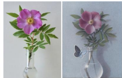
3. Reference photo and painting in color